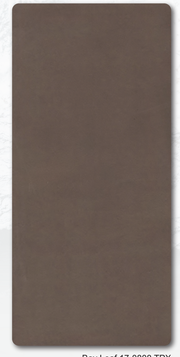
Bay Leaf 17-0808 TPX