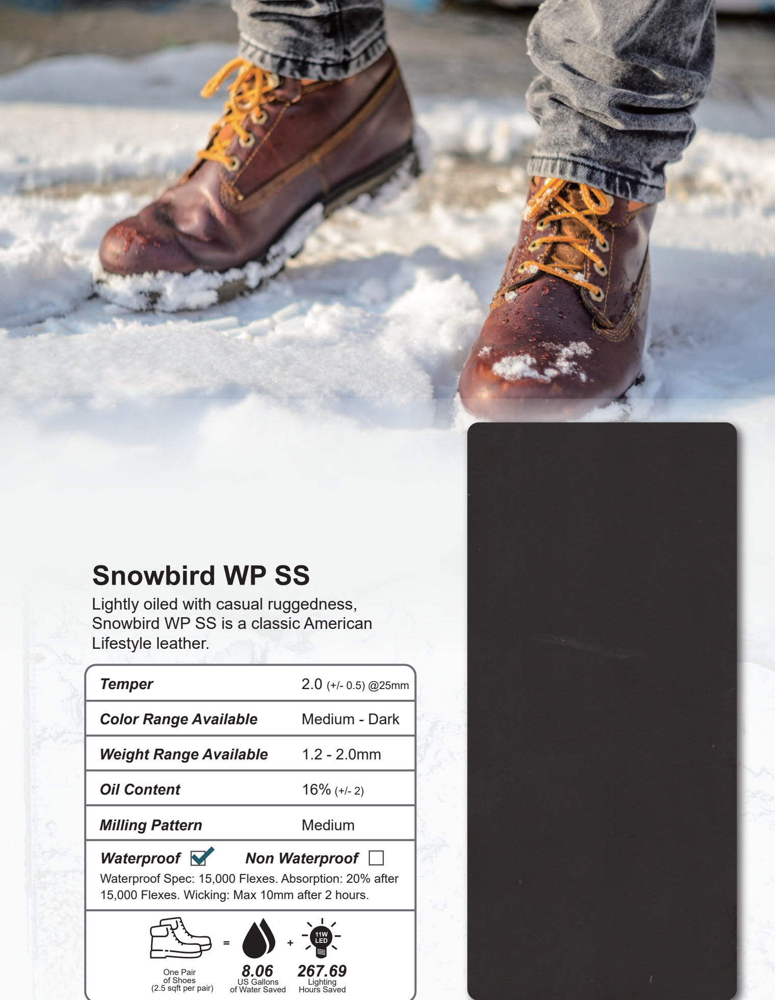
Cocoa 19-1235 TPX