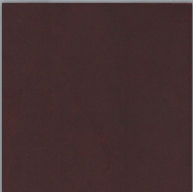
Snowplow WP Red Eye