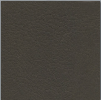
Barrier WPSS Olive Night